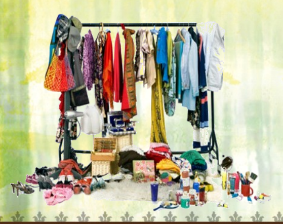
Table Space -$10.00 (only 20 tables available) $5.00 for an outside space (spaces unlimited) Food & Refreshments will be available for purchase. Tables or spaces can be purchased at The Rec Office No Payments Will Be Accepted The Day Of The Yard Sale!

Saturday June 13th From 9am-3pm At The Clubhouse