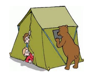
Campground Closes 10/29/23 For The Season